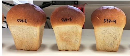
Figure 1. Falling number (A) and baking performance (B) of spring wheat genotypes from this study.