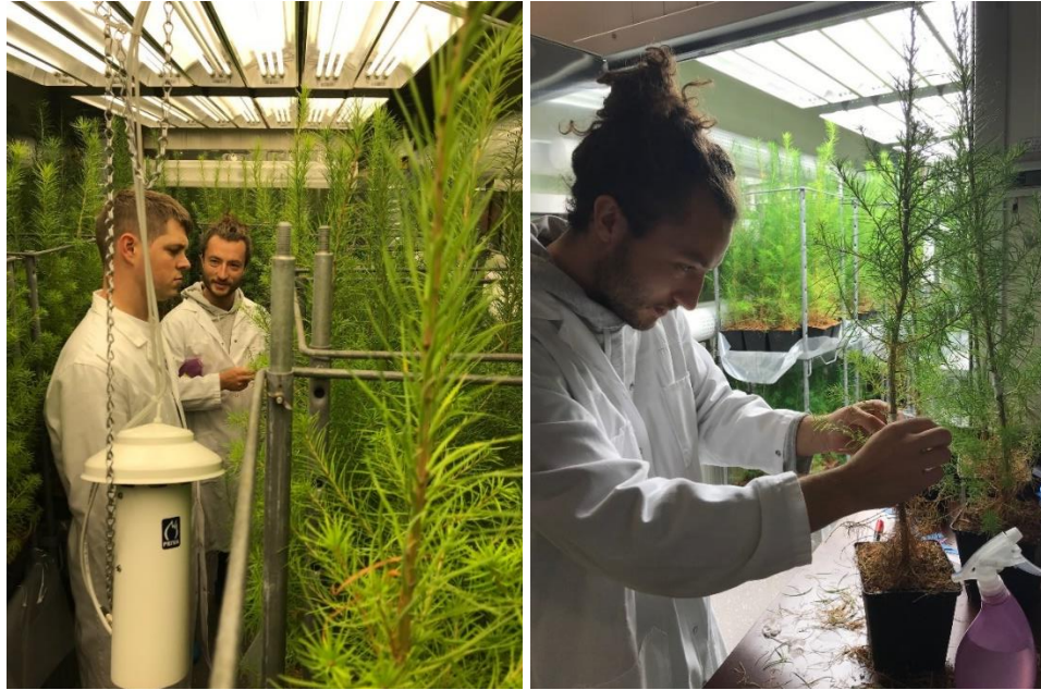
Figure 3. Greenhouse inoculation trial with European larch, inoculum substrate and isolate treatments applied to plants.

After three months, all seedlings showed necrosis around and inside the artificial wound, and callus formation and resin outflow was observed. In testing different inoculum substrates, the agar plug seems to have higher inoculum potential (resulting in significantly longer lesion lengths) than the woody inoculum (Figure 4). In addition, there were no significant differences in lesion length among the different fungal isolates used in the study (Figure 5).