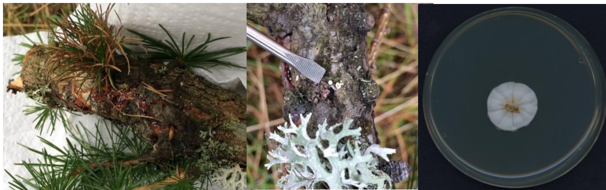
Figure 2. Left: Canker with resin outflow; Middle: Removal of apothecia from infested branch; Right: pure fungal culture of L. willkommii

In the project we sought out and collected local isolates of L. willkommii from diseased European larch from known locations in Sävar and Kättnas. Branch cankers exhibiting characteristic symptoms (branch swellings, necrotic lesions, resin flow) and signs (i.e. fruiting bodies) of larch canker. In order to confirm the identity of L. willkommii on samples, and to exclude the possibility of having collected and isolated the similar species L. occidentalis , isolations were made from the apothecia and DNA analyses performed to confirm fungal species identification (Figure 2).