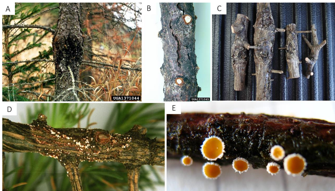
Figure 1. A) Resinous stem canker on European larch infected with Lachnellula willkommii ; B) Swelling and cracking of bark on infected stem; C) branch swelling and resinous areas around lesions; D) fruiting of L. willkommii on diseased branch; E) apothecia (reproductive fruiting body) of L. willkommii on European larch

Damage caused by the fungus appears as swellings on twigs and branches, and sunken cankers on larger stems (Figure 1). The first circular or elliptical depressions often form around dwarf shoots. Resin is commonly exuded from lesions. The bark cracks and is loosened. A ridge of wood develops around enlarging cankers on stems and trunks as the tree grows. Needles above the canker shrivel up and die or turn yellow early. If the stem or trunk is girdled, branches and young trees will die.